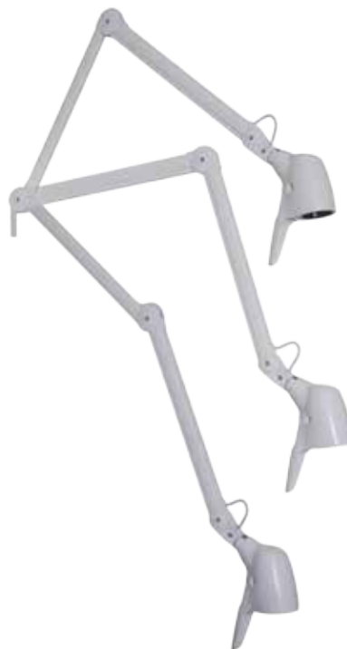
Arms for wall mounting always tilt forward, and are designed for maximum vertical movement.